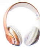
HOT TECH + TOYS