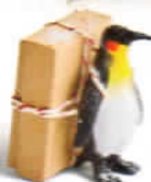
AVOID WINTER COLDS